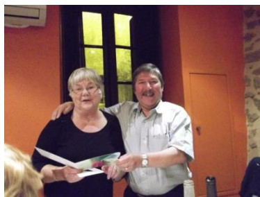
On the Canal du Midi

Sixteen members had a marvellous visit to Carcassonne, Avignon and Beziers from 5 th - 10 th October 2011. Members are asked to send in the best of their photos to display here.