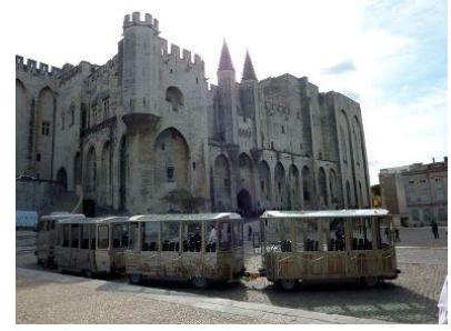
The Pope's palace in Avignon