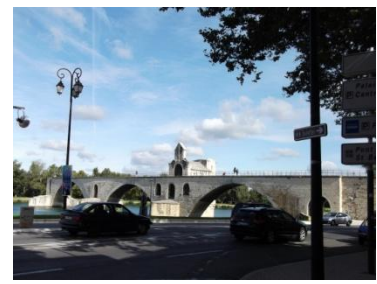
The 4 castles of Lastours