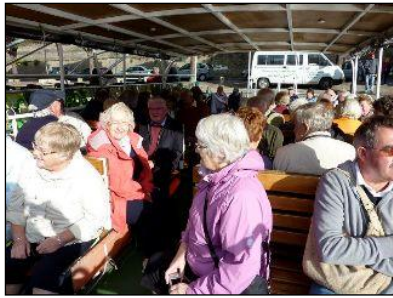
Canal du Midi trip